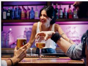
Bar & Nightclub